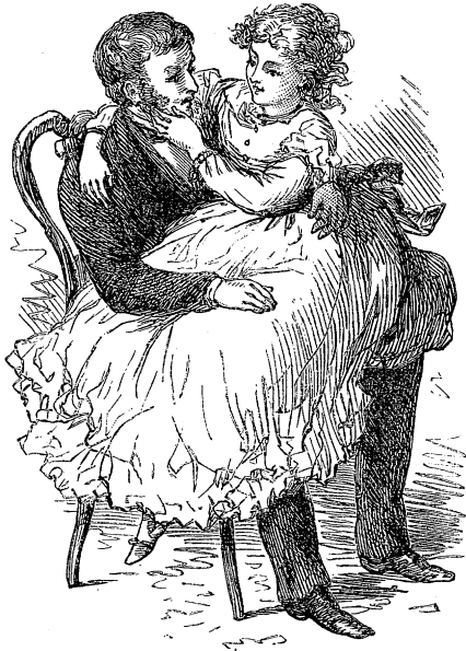
“She perched herself on his knee.”

whiskers so saucily, and then, springing up, began arraying herself in such an astonishing daintiness of device, and fluttering before him with such a variety of well-assorted plumage, that John was quite taken off his feet.